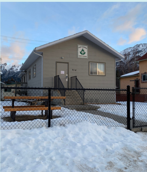
Scout Hall, 914 8 St. Canmore, AB